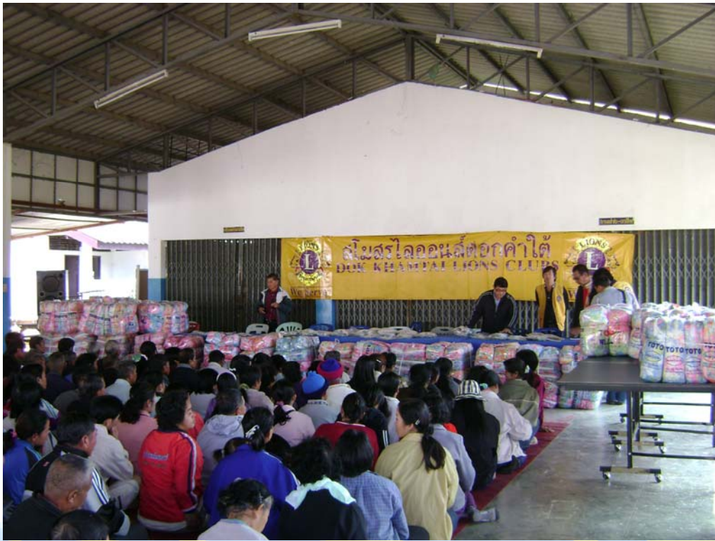
The Dok Khamtai Lions and their blankets in the Nonglao Amphur Phusang Community Center