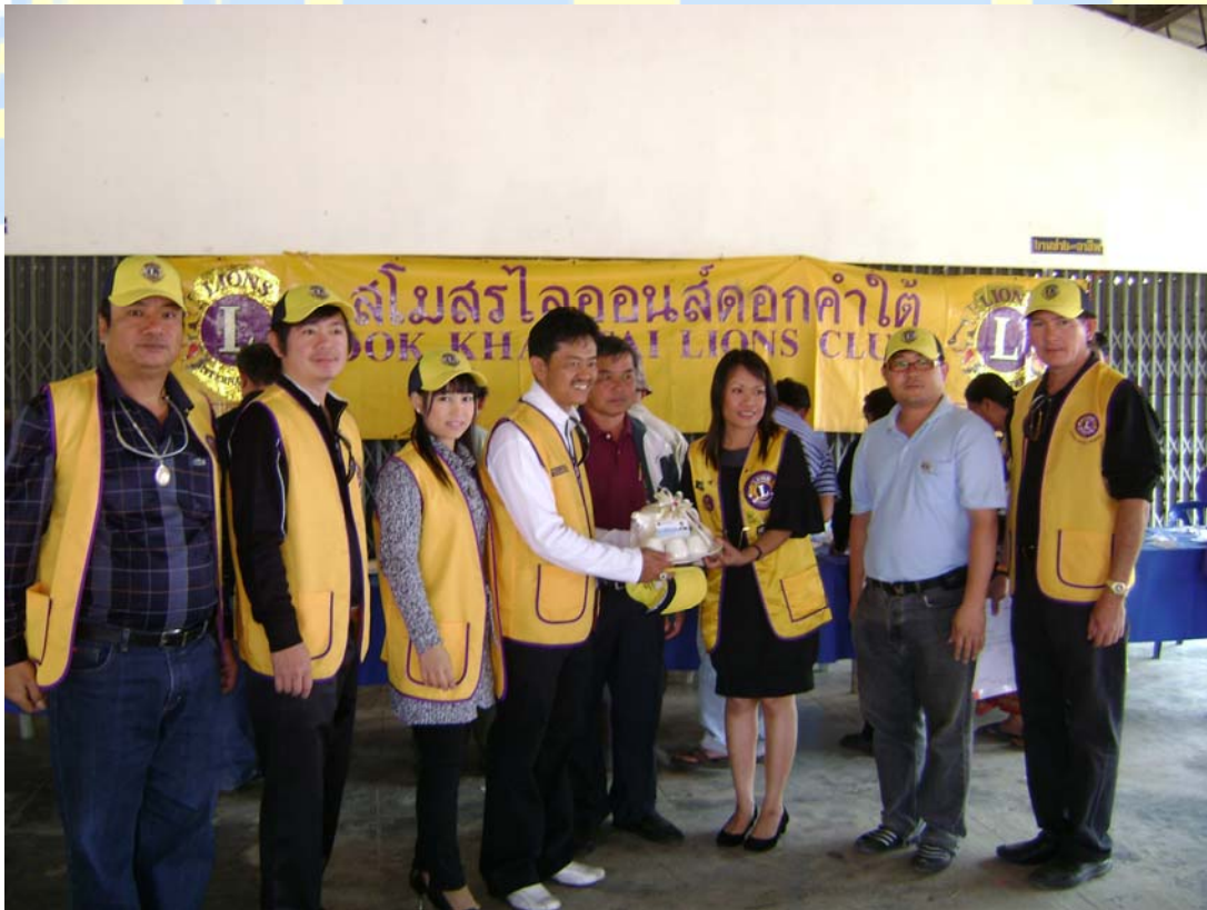
Check out those snappy looking hats!