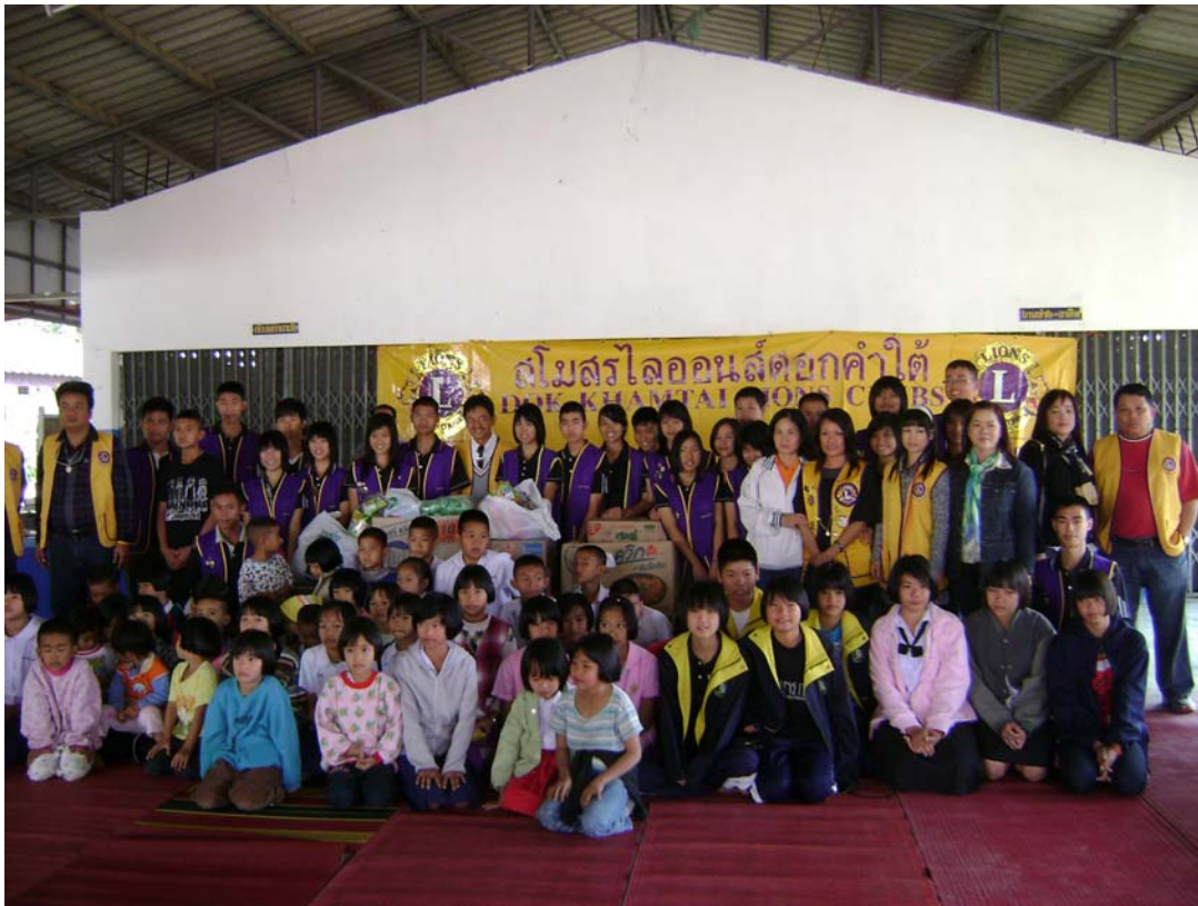
New Orleans Filipino American Lions and the Dok Khamtai Lions working together. The Leo Club sponsored by the Dok Khamtai Lions is also shown here.