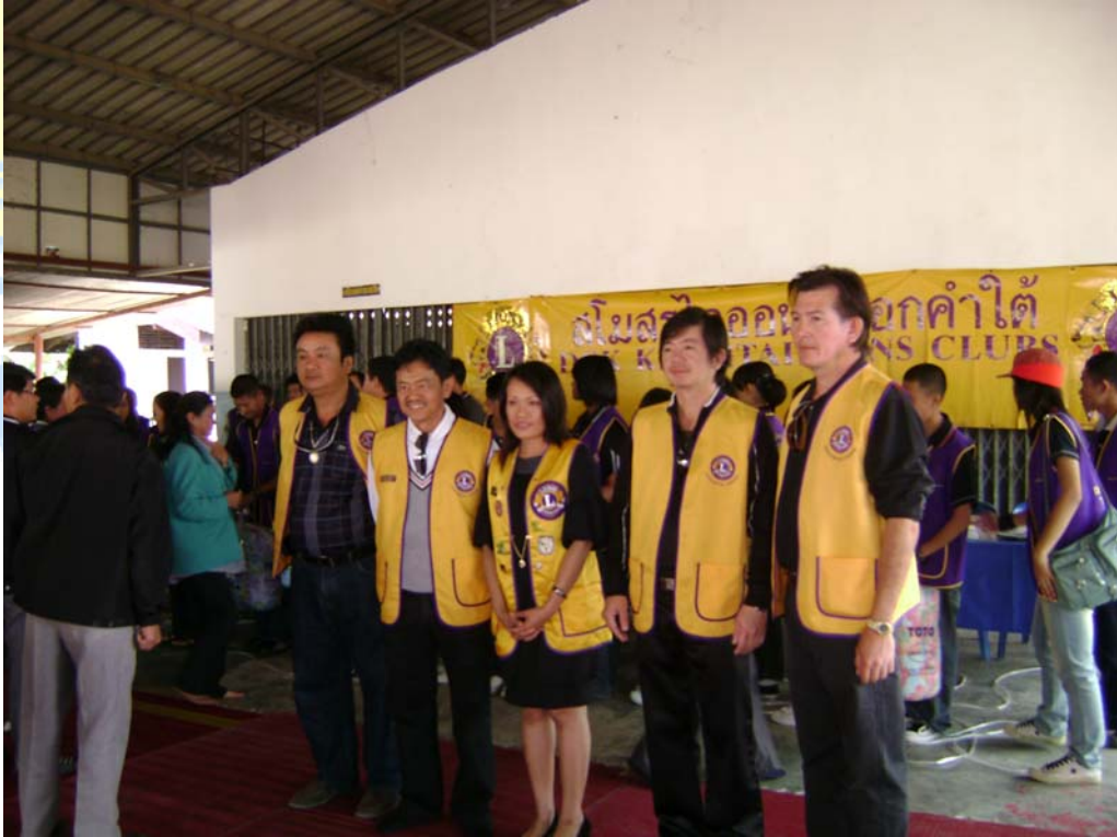
Lions Across Borders